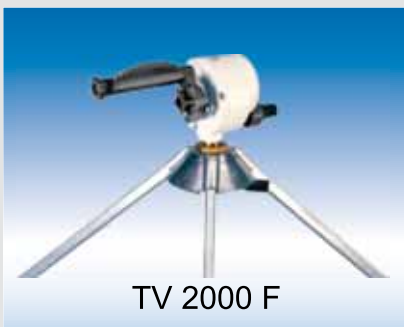
TV 2000 F

A quality product from PERROT. Dirt resistant, excellent water distribution, with diffuser pin. Sec- be adjusted (9/15). Range selec- tor (left, right, center, full).