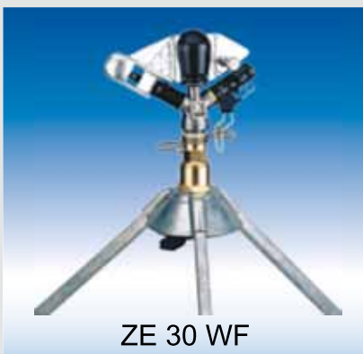
ZE 30 WF